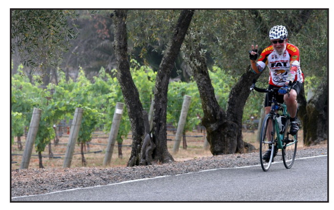
Cover Photo: Downtown Cloverdale

Recreational Adventures: Incredible recreation opportunities can also be found in Cloverdale and Geyserville. Both are near the Russian River and Lake Sonoma. There are countless opportunities for cycling, hiking, swimming, fishing, boating, sky-diving and picnicking. Above Geyserville is the Mayacamas Sanctuary, North County's remote outpost, which hosts public guided hikes. It is also a favorite spot for birding.