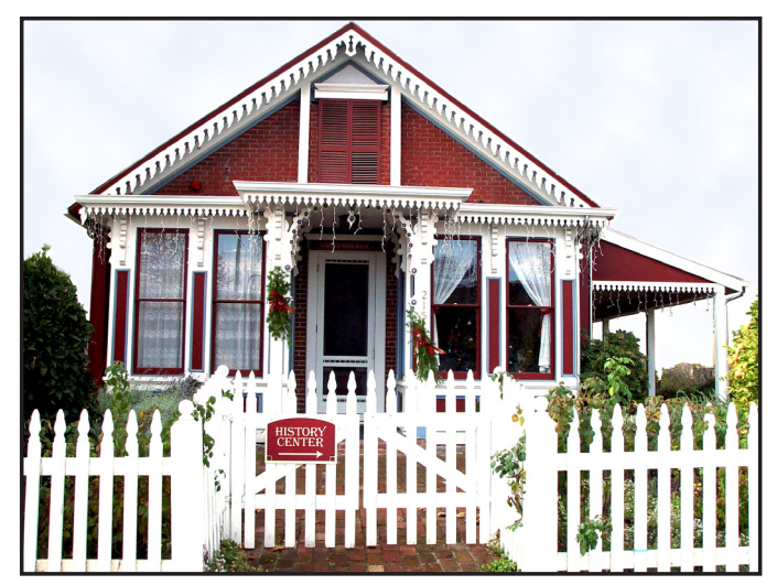
and treasures. The exhibits reflect a sense of everyday life in Cloverdale since it was the home of the Pomo Indians. Close to the History Center are historic homes and buildings worth exploring.

History Tours: Docent or Self-Guided Tours Cloverdale: The Cloverdale Historical Museum is located in the Gould-Shaw House, a rare example of Gothic Revival architecture from the Victorian Era. The house appears today much as it did in 1862. The History Center located next to the Gould-Shaw House has a diverse collection of artifacts